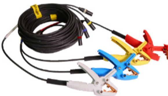
16 A X leads - MTOU3 BASIC, MTOU3 ADV