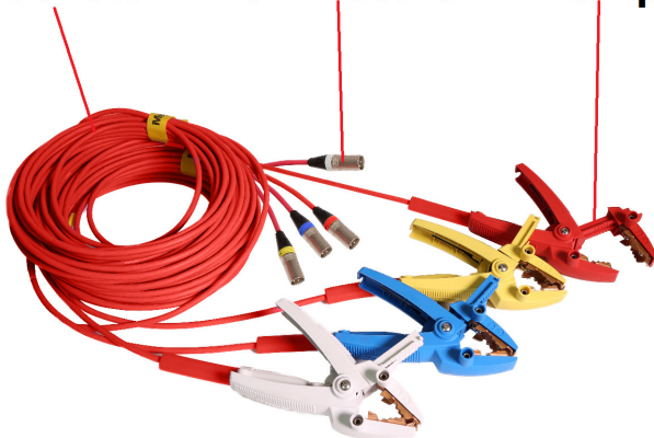
16 A H leads TAU3 BASIC, TAU3 ADV, TAU3 PRO, TAU3 EXP