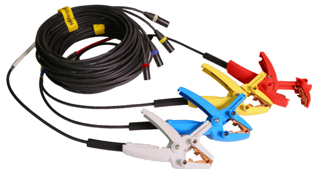
16 A X leads TAU3 BASIC, TAU3 ADV