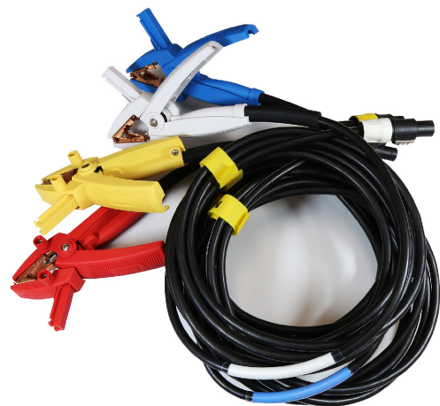
32 A X leads TAU3 PRO, TAU3 EXP